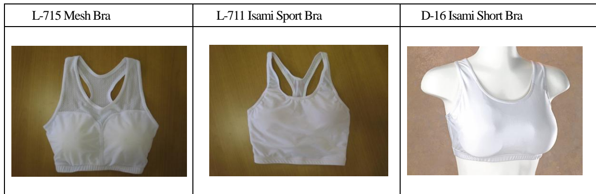
SS-6 Under Guard for Women (Official Protector)