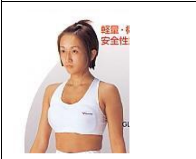
GL-28Winning Chest Guard

Winning products can be purchased at http://www.d7.dion.ne.jp/~winning/